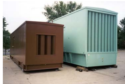
ACOUSTIC / AERODYNAMIC ENGEN ENCLOSURES