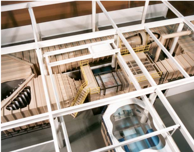
ENGINEERED SYSTEMS: ACOUSTICALLY TREATED AERODYNAMIC WIND TUNNEL